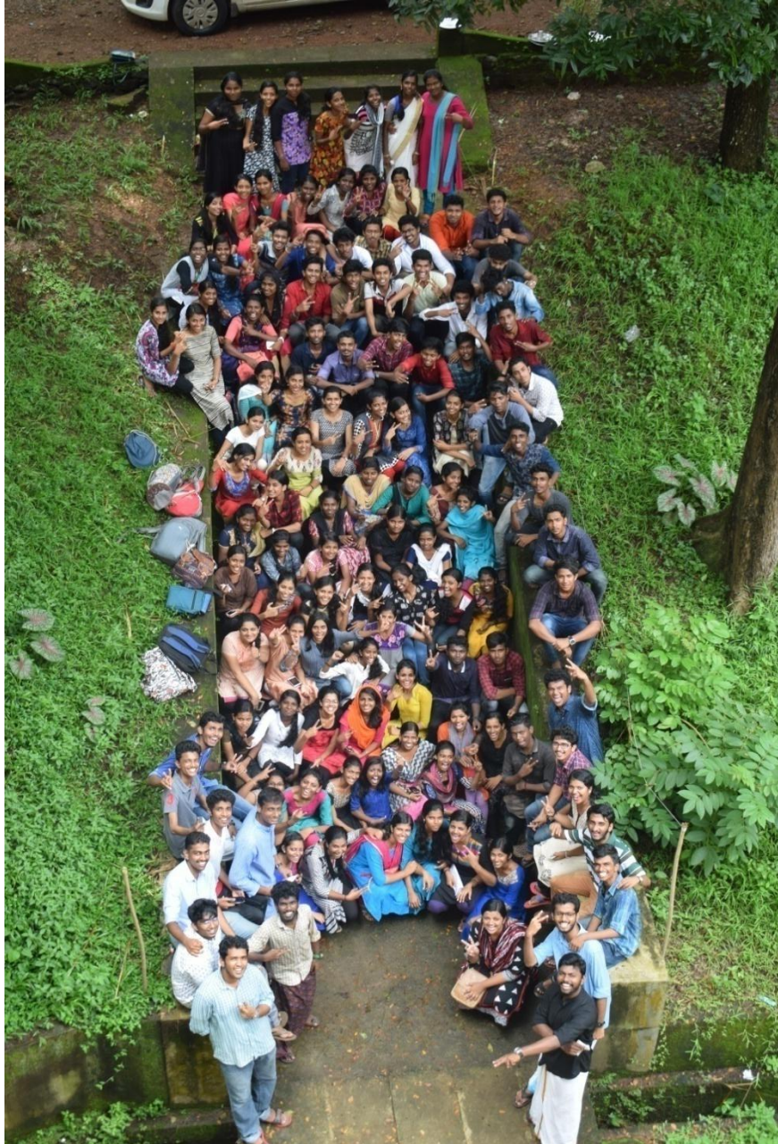
CHRISTMAS CELEBRATION AT GOVT UP SCHOOL