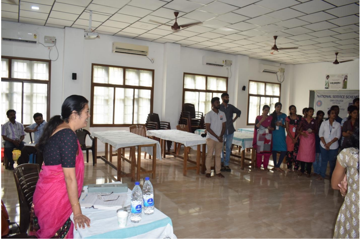
GANDHI JAYANTHI (AT UP SCHOOL, THIRUVARPU)