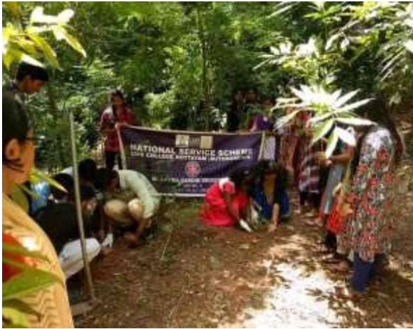
Volunteers working in the garden