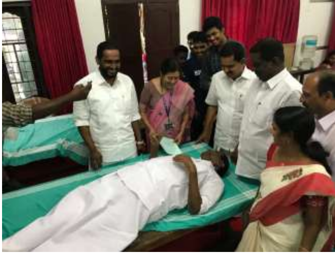
MLA donating his blood