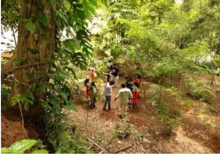
Volunteers preparing the garden.